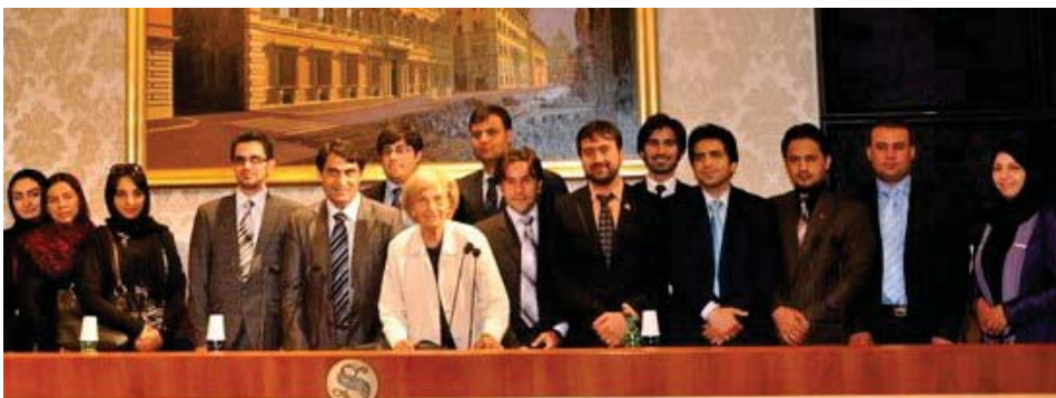
Italian Foreign Minister Emma Bonino with Afghan Trainees in one of our past trainings